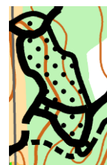
New map 1: 15 000