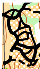
Old map 1:10 000